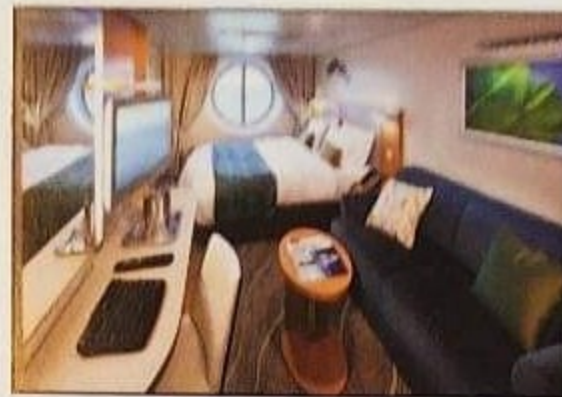
Obstructed Oceanview Staterooms