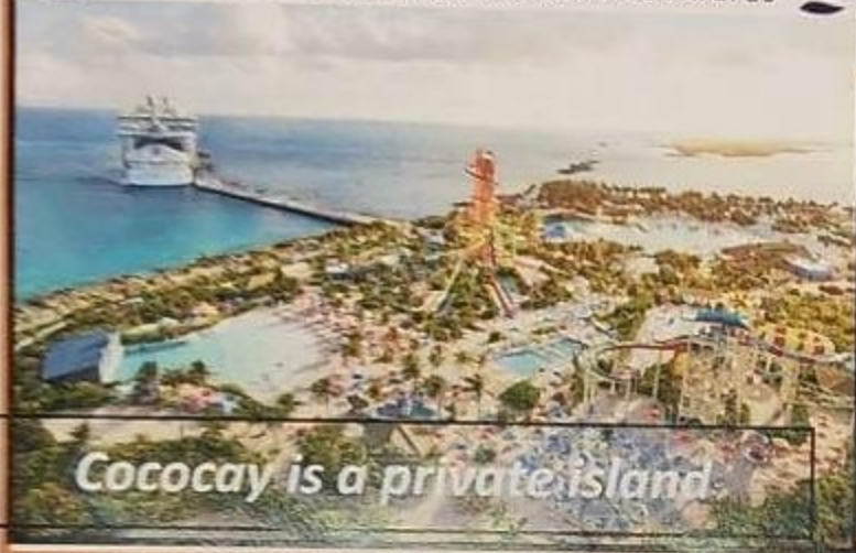
Cococay is a private island.